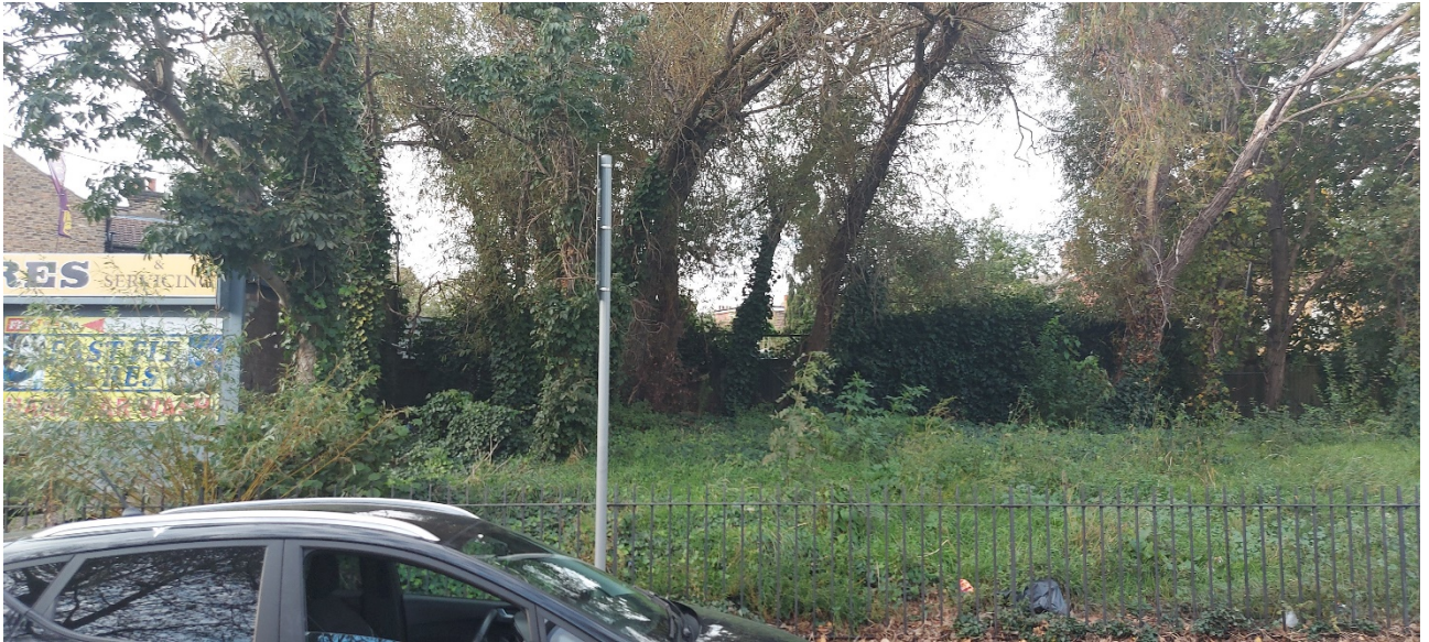
Photo 4 showing trees and shrubs from St Awdrys Road. (This part Wedderburn Road site will be retained by the council)